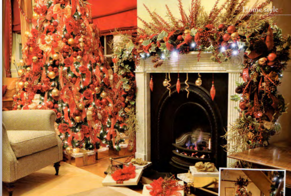
Bring the outside in with roses on your tree. Cost: around £1300 for the whole tree and all the trimmings. Swags of greenery and opulent ribbons are intertwined with luxury baubles to adorn the fireplace. Cost: around £300.

The Christmas Decorators will decorate your whole house, from banisters to mantelpieces and from table decorations to trees, then take them down and store them until next year. You are charged for all the decorations in the first year and thereafter only for the arranging and styling. They will also decorate the outside of your house with lights. So, here we show you a glimpse of what the best-dressed houses will be wearing this Christmas.